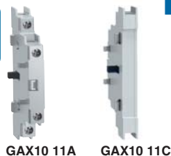
GAX10 11A GAX10 11C